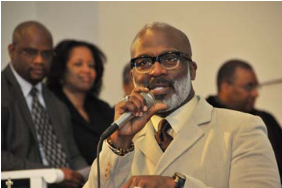
Gospel singer Bebe Winans visited to promote the Arena Stage play of his life, Born For This.