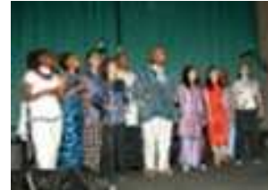
Choirs & Groups