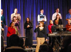
Praise & Worship