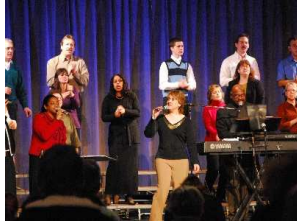
Praise & Worship